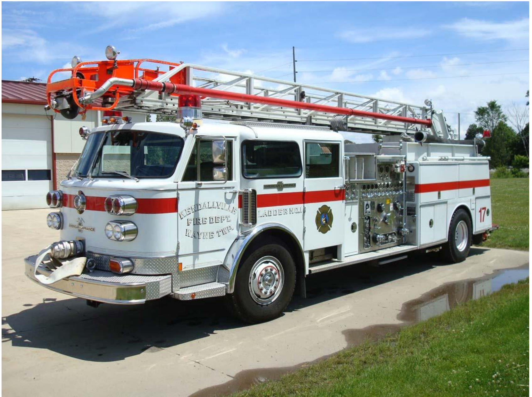
1984 American LaFrance 75' Ladder, 1500 GPM Pump, 300 Gal. Tank